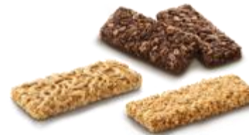
BARS / MUFFINS